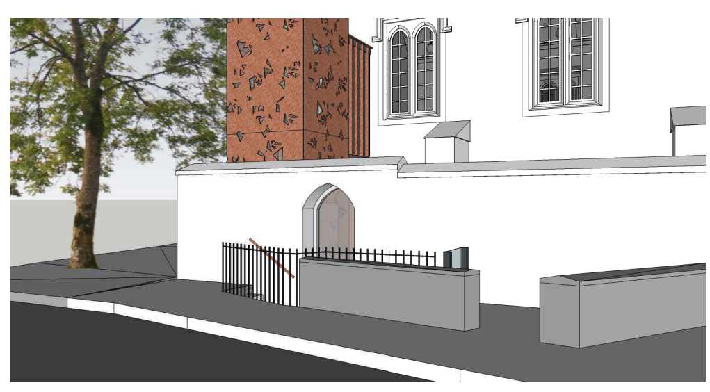
Sketch Model View 1