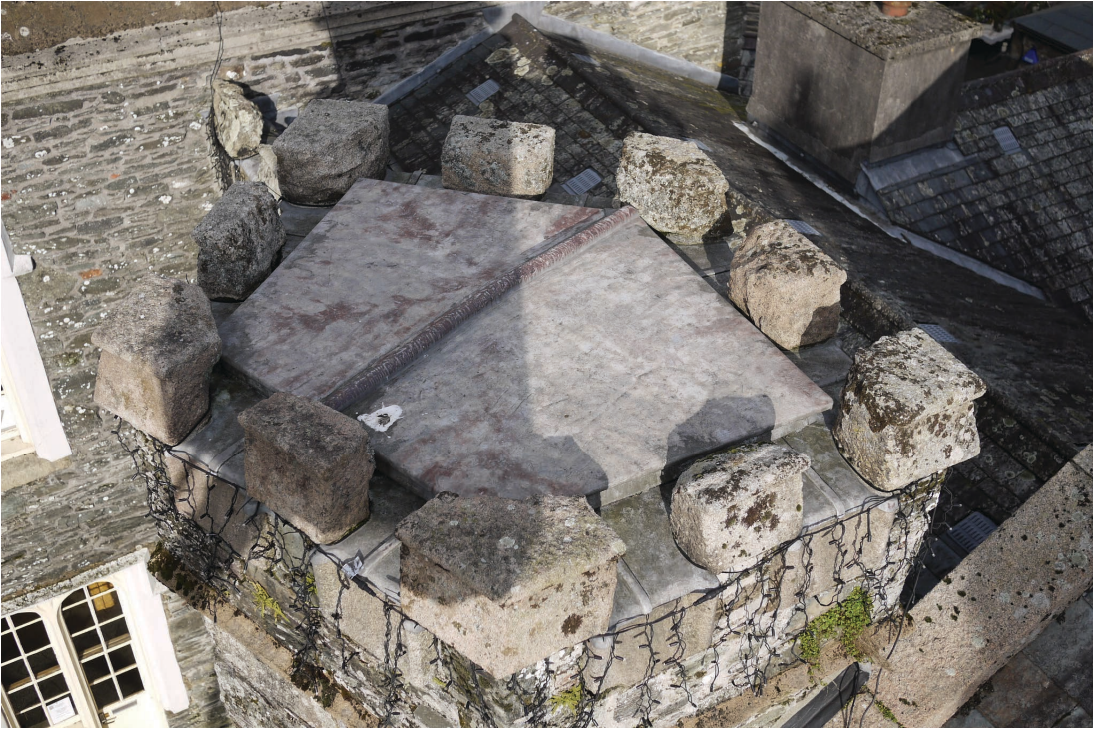
Photo of Neighbouring Museum Stair Tower Lead Roof