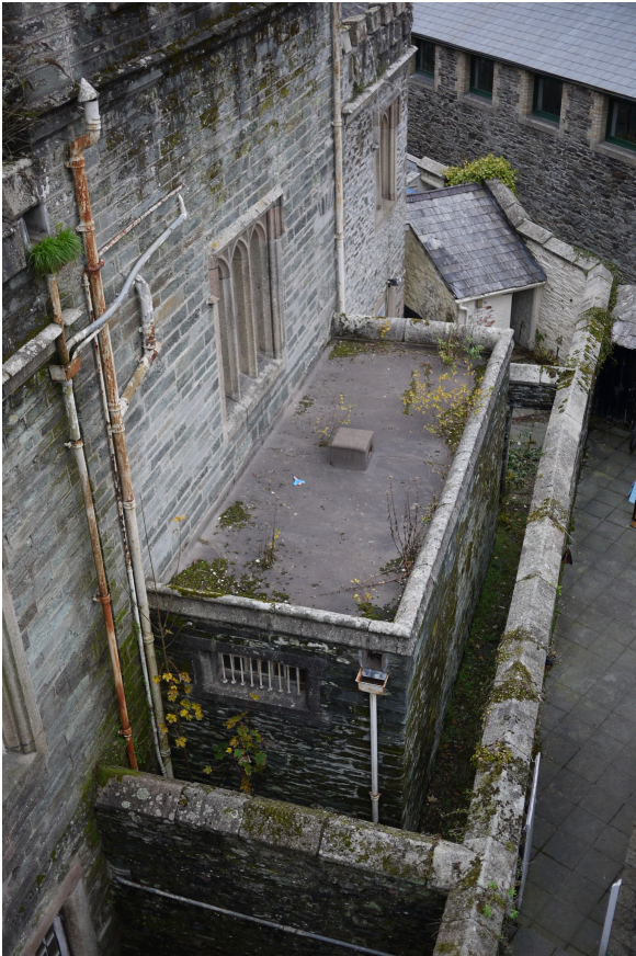
Trowtes House - Existing Flat Roof

Existing Ventilation box to be investigated and removed in no longer deemed to be required. If needed to be retained, single ply to be dressed up and around.