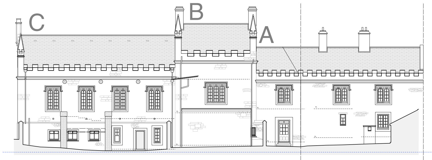
tavistock guildhall river / market east elevation as existing - 1:100 @ A1