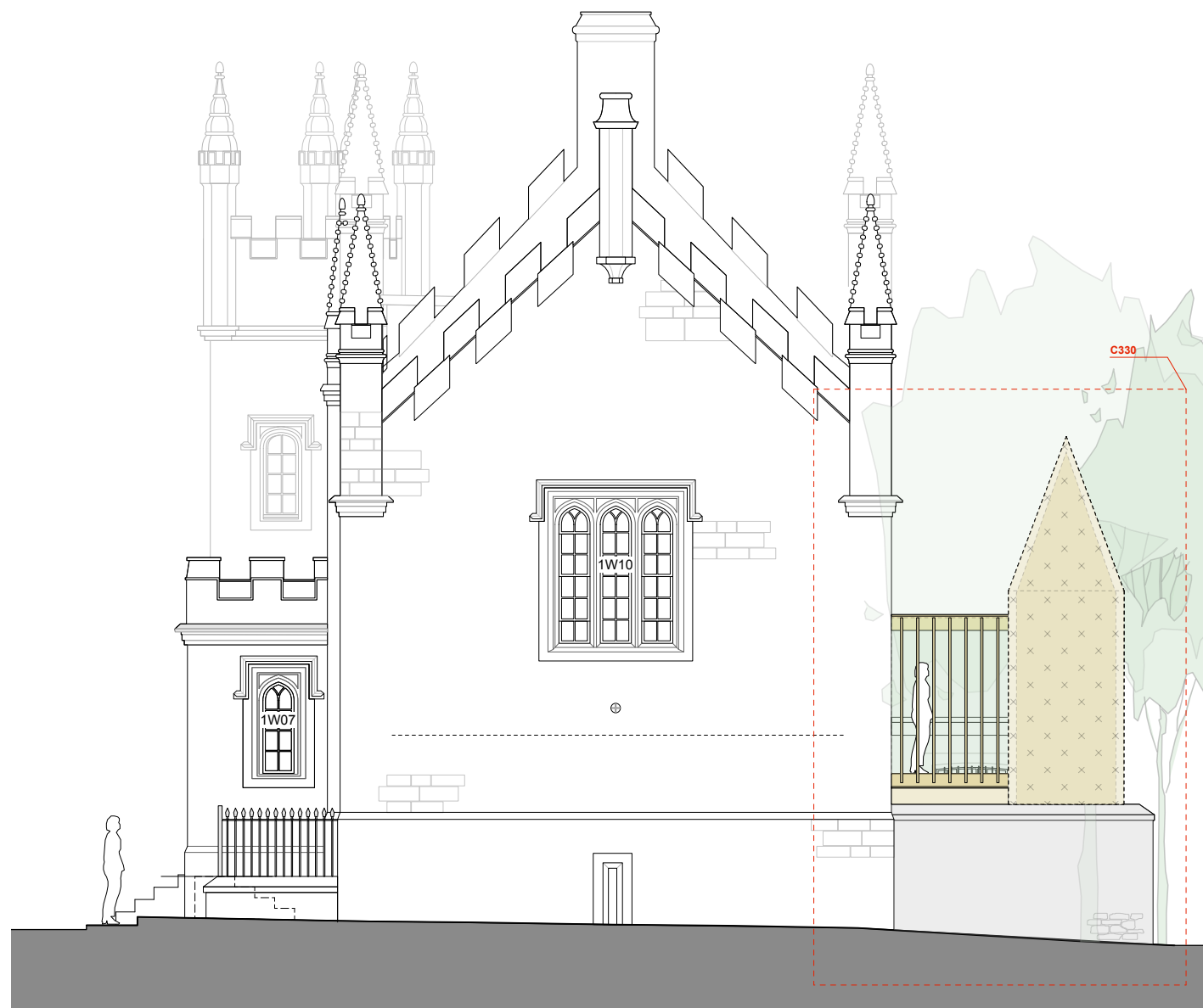
tavistock guildhall TTC: south elevation - as proposed