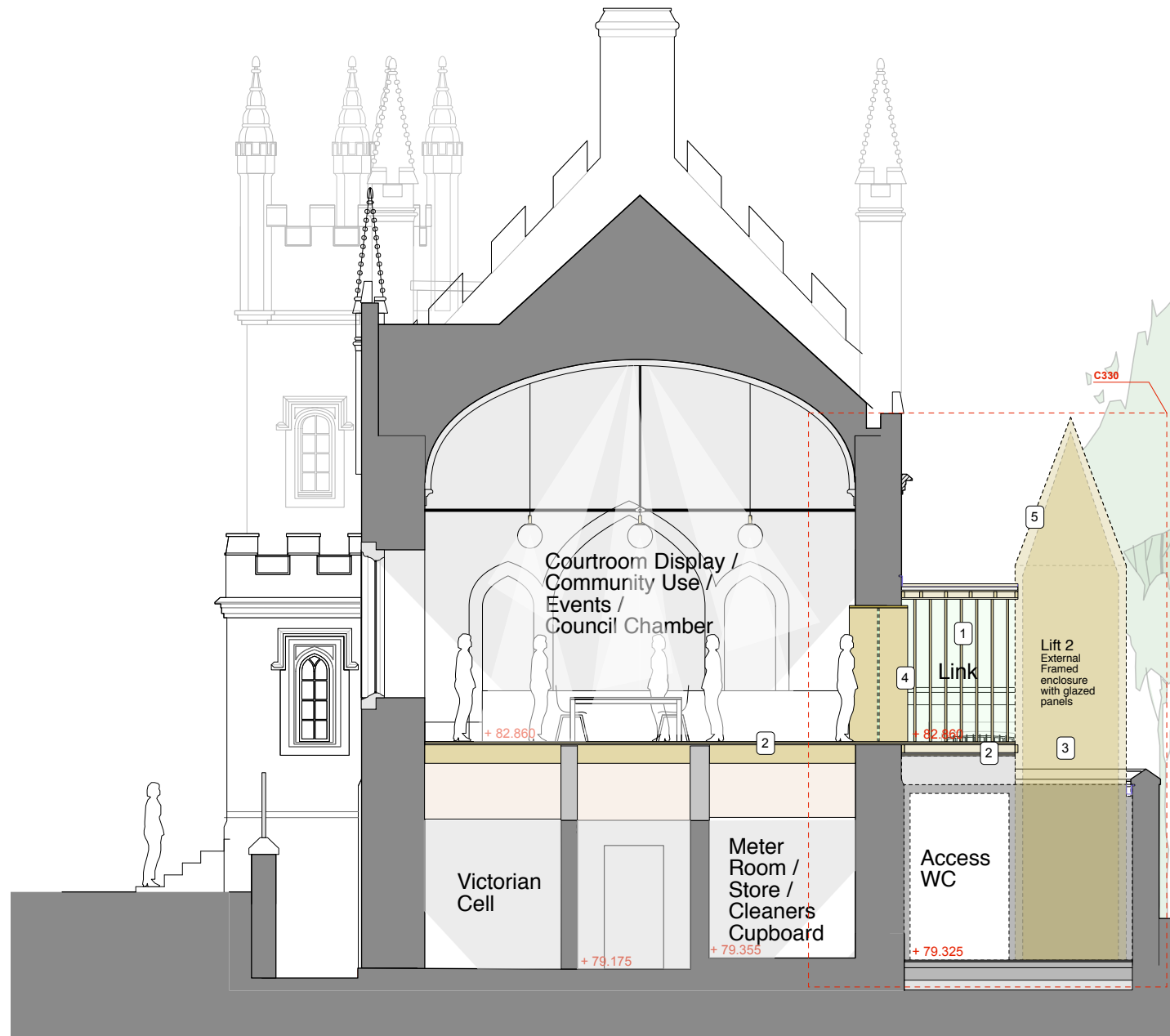
tavistock guildhall TTC: section f-f - courthouse as proposed

FOR ROOF DETAIL PLEASE REFER TO GA216 - Fabric Repair Roof Plan