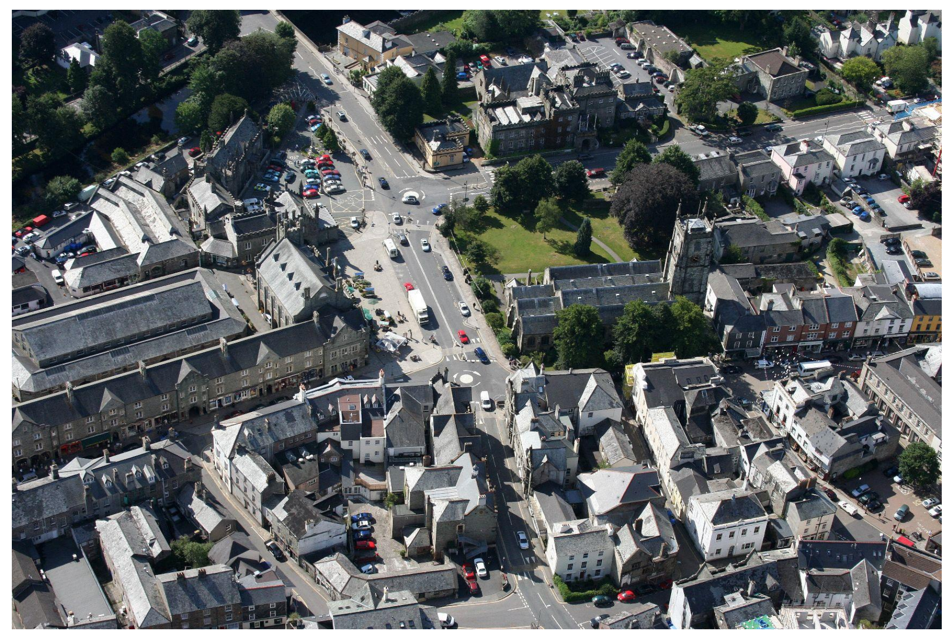
Tavistock Town Centre