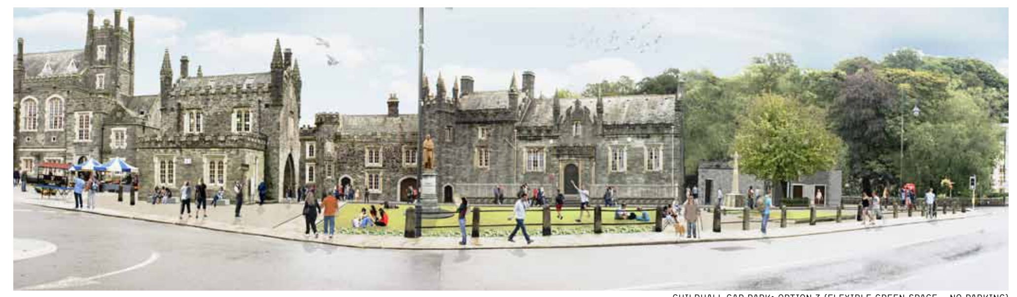
GUILDHALL CAR PARK: OPTION 3 (FLEXIBLE GREEN SPACE - NO PARKING)