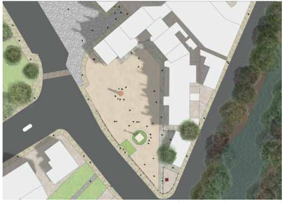
GUILDHALL CAR PARK: OPTION 2 (FLEXIBLE HARD SPACE - NO PARKING)