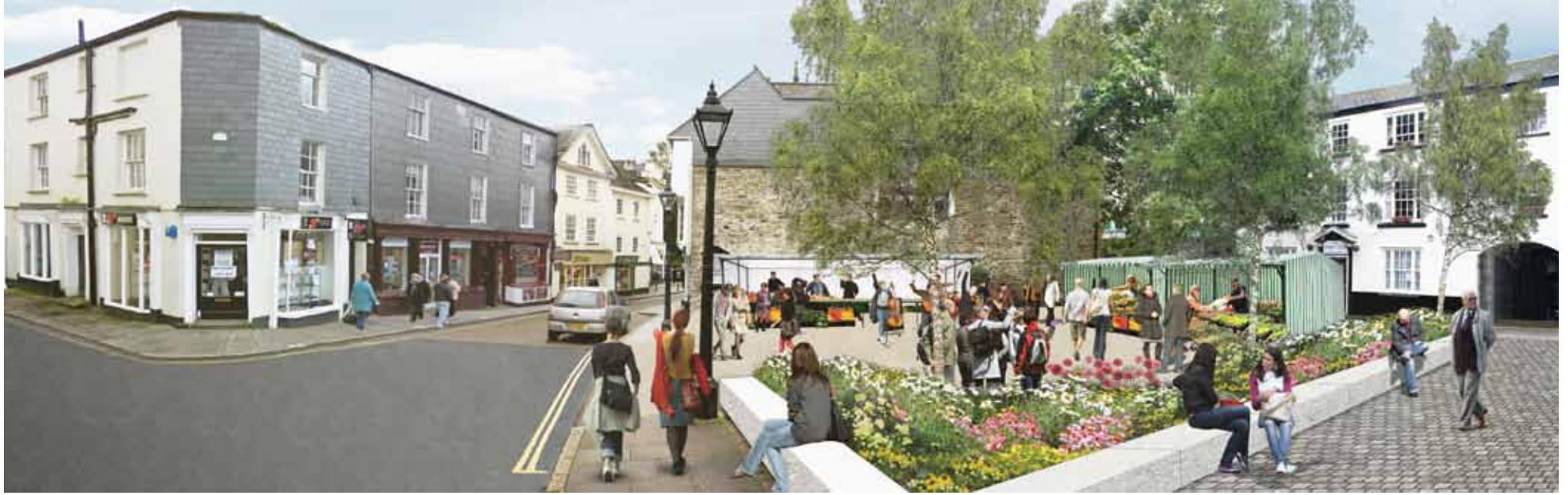
BANK SQUARE: OPTION 2B (FLEXIBLE HARD SPACE)