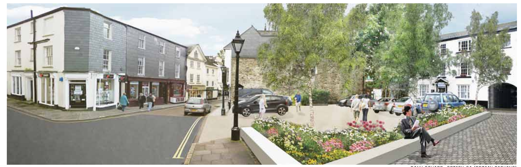
BANK SQUARE: OPTION 2A (RETAIN PARKING)