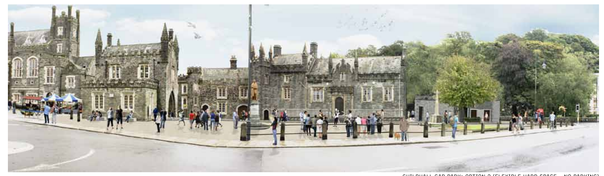
GUILDHALL CAR PARK: OPTION 2 (FLEXIBLE HARD SPACE - NO PARKING)