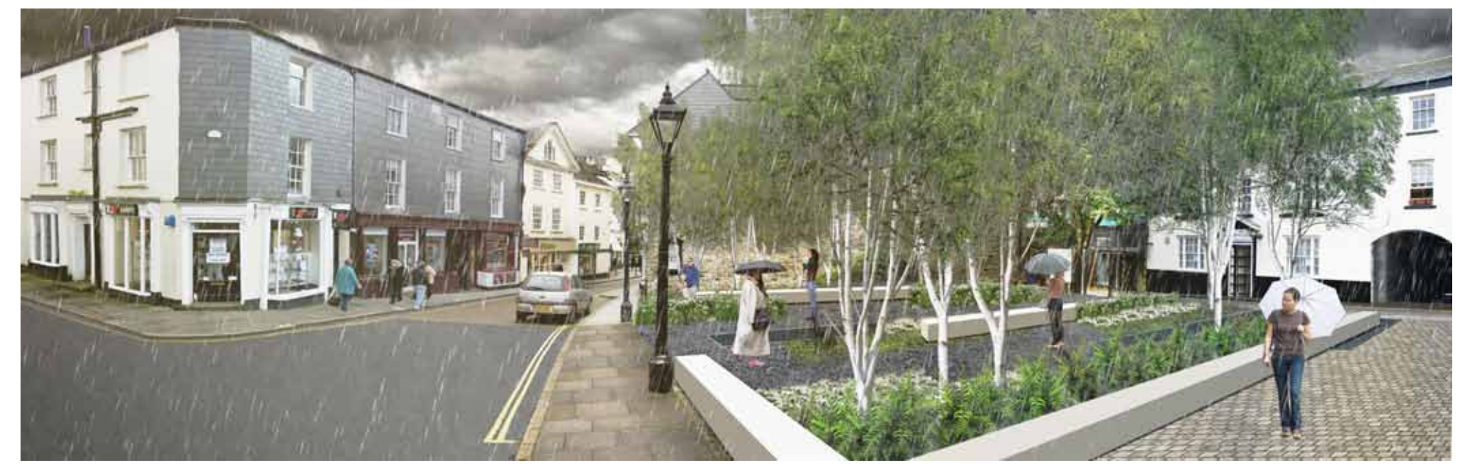
BANK SQUARE: OPTION 1 (RAINWATER GARDEN)