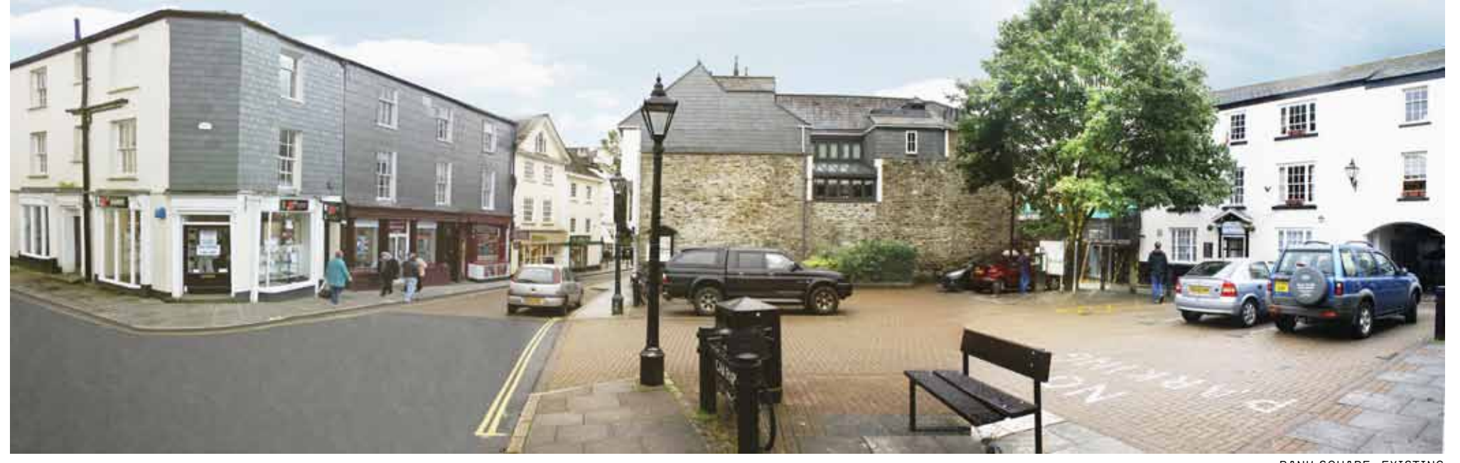
BANK SQUARE: EXISTING