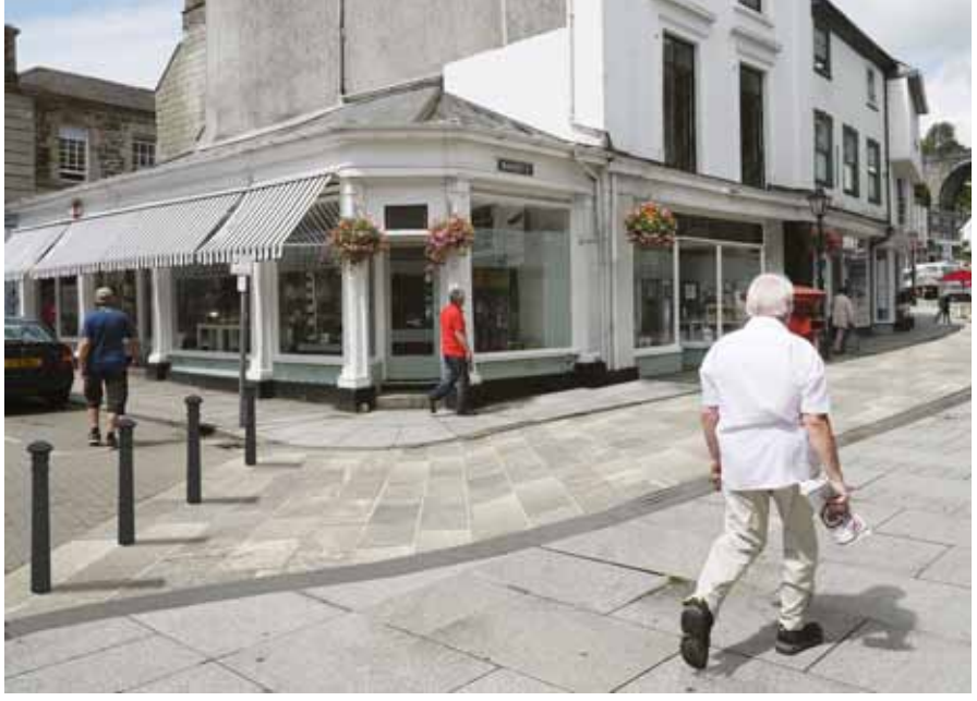
MARKET STREET: PROPOSED PEDESTRIANISATION