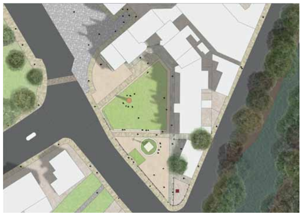
GUILDHALL CAR PARK: OPTION 3 (FLEXIBLE GREEN SPACE - NO PARKING)