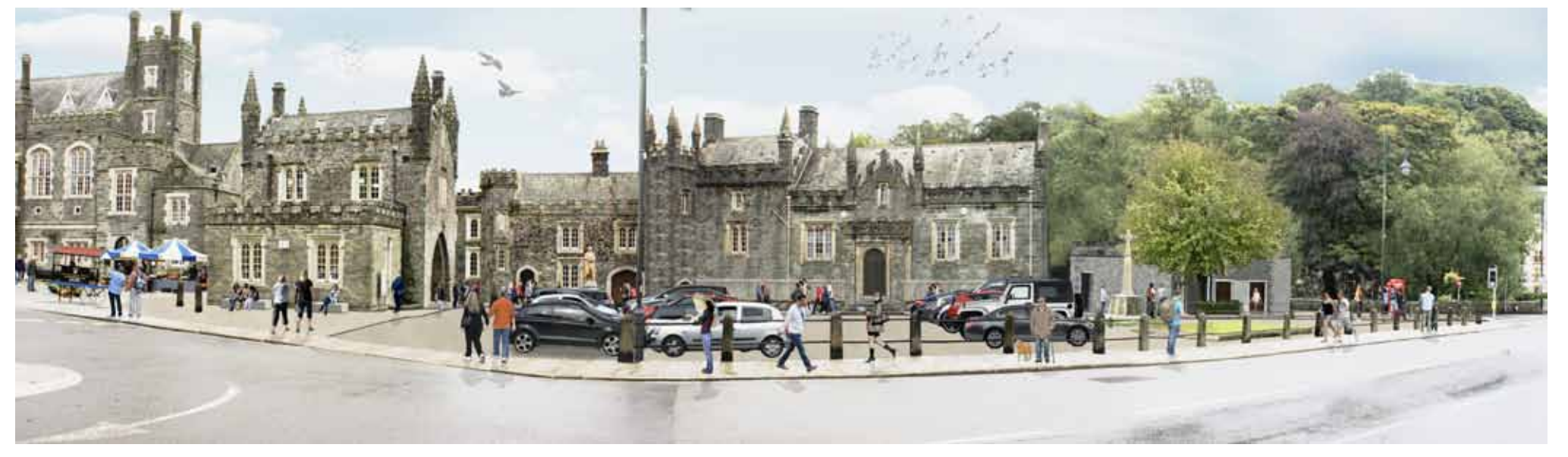
GUILDHALL CAR PARK: OPTION 1B RETAIN PARKING - 21 SPACE VARIANT (HEDGE REMOVED FOR COMPARISON)